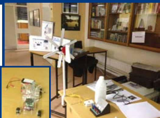
Model Hydrogen Car